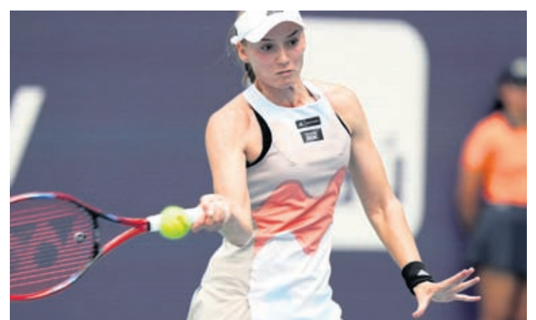
Elena Rybakina of Kazakhstan returns to Martina Trevisan of Italy during the Miami Open tennis tournament, Tuesday, March 28, 2023, in Miami Gardens, Fla.

In fourth-round men's action Tuesday, Taylor Fritz and Jannik Sinner beat seeded opponents in straight sets.